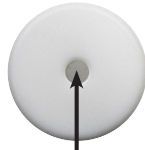
Top view showing insertion hole where probe is to be placed.