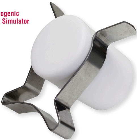
#10184 Lab/Cryogenic Product Simulator Sleeve